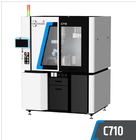
Collaborative polishing cell developed by polishers for polishers