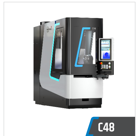
Compact grinding centre for greener, faster, more efficient and smarter production.