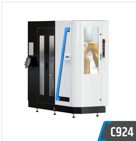
Compact loading cell equipped with a polyarticulated robot