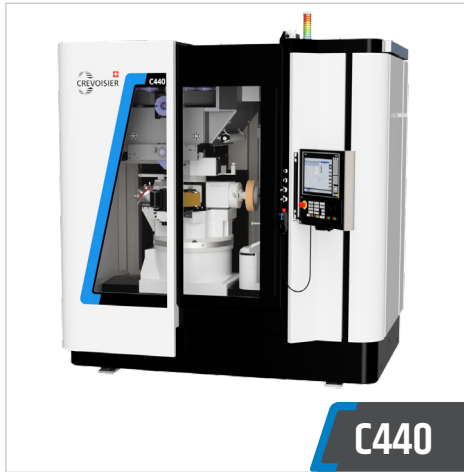
Machining, grinding and finishing centre The versatility of a Swiss army knife, for the full package