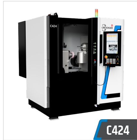
Finishing centre in several configurations An economic solution for tackling new challenges